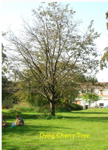
Dying Cherry Tree